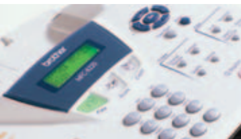
Backlit function keys Enable instant access to each function

▲Please see driver table for details on your operating system.