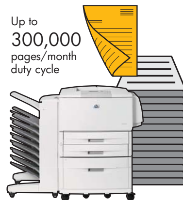
Large volume printing