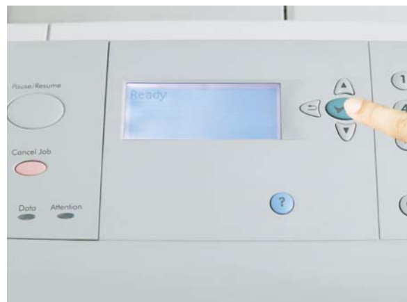
Full function control panel for walk-up useability