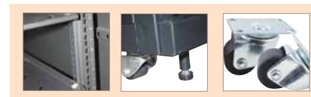
Increased Shelf Depth