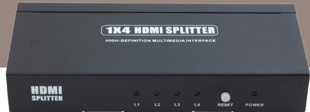
HDMI SPLITTER 4 PORTS HDMISP4P

So it is best suited for application where the signal source is required at multiple locations such as sharing of TV, DVD, set-top-box, gaming console and computer. Such requirements can often be found in home entertainment, office, commercial or industrial applications.